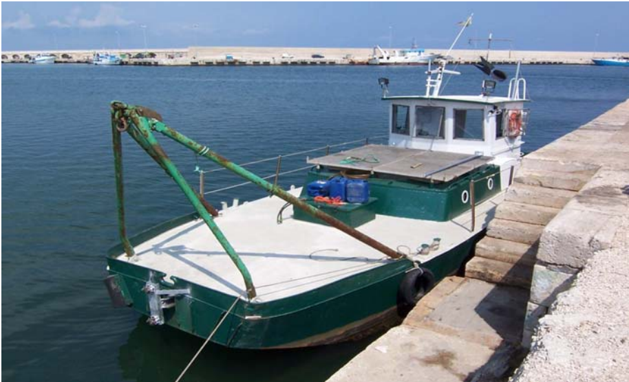
Barge used for survey

SWATHplus-H survey of beach development area off of Bari. Survey area of 2.6km by 2 km, in water depths 0 to 14m. Area surveyed within a day including transits from Mola di Bari.